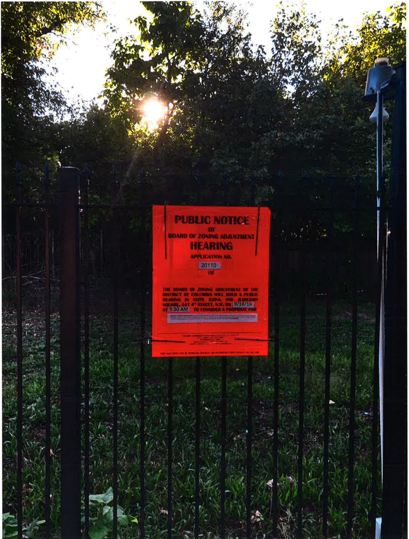
8/29/19 Alabama Avenue SE #2